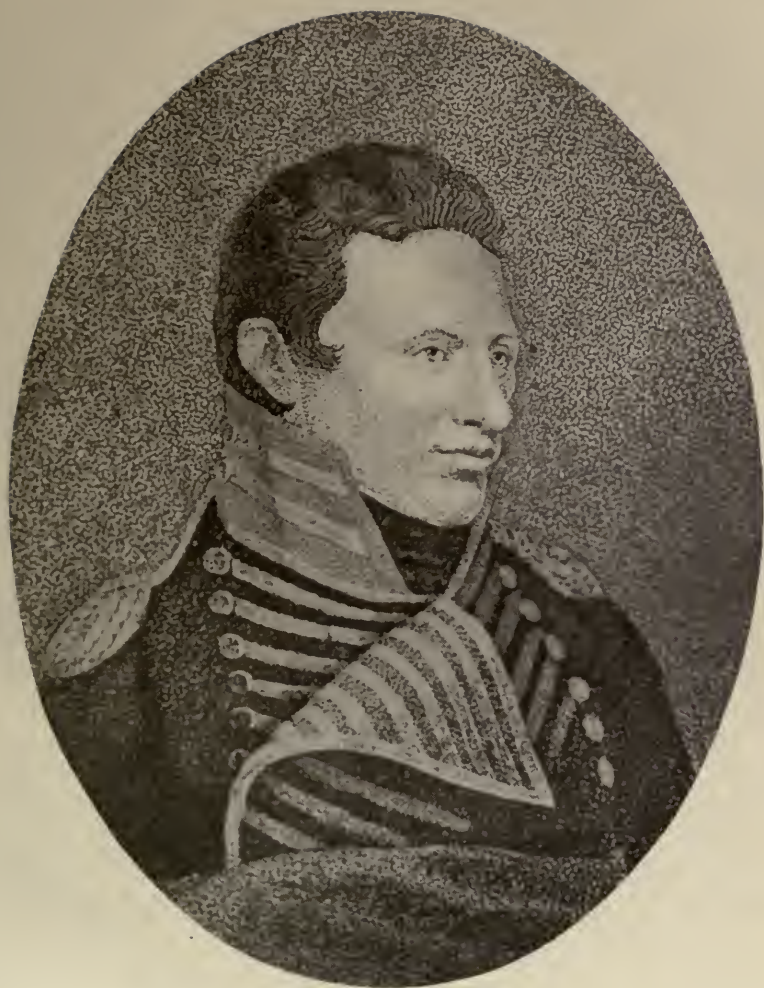
ZEBULON M. PIKE.